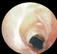
Before treatment (7 mm diameter)