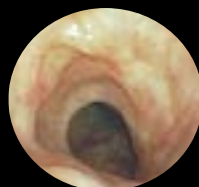
4 months post- treatment (14.5 mm diameter)