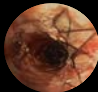
15 min. post- treatment